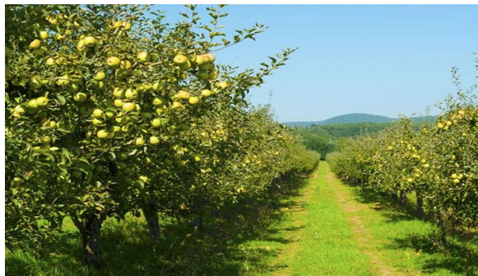
Figure 3 - View of an organic apple orchard

The number of nitrogen-fixing bacteria from the genus Azotobacter in the soil under Golden Delicious trees was greater in the Al Karal (G-3), BioSok Energy Plus (G-4), and Agrofloirin (G-2) variants than in the control (G-1).